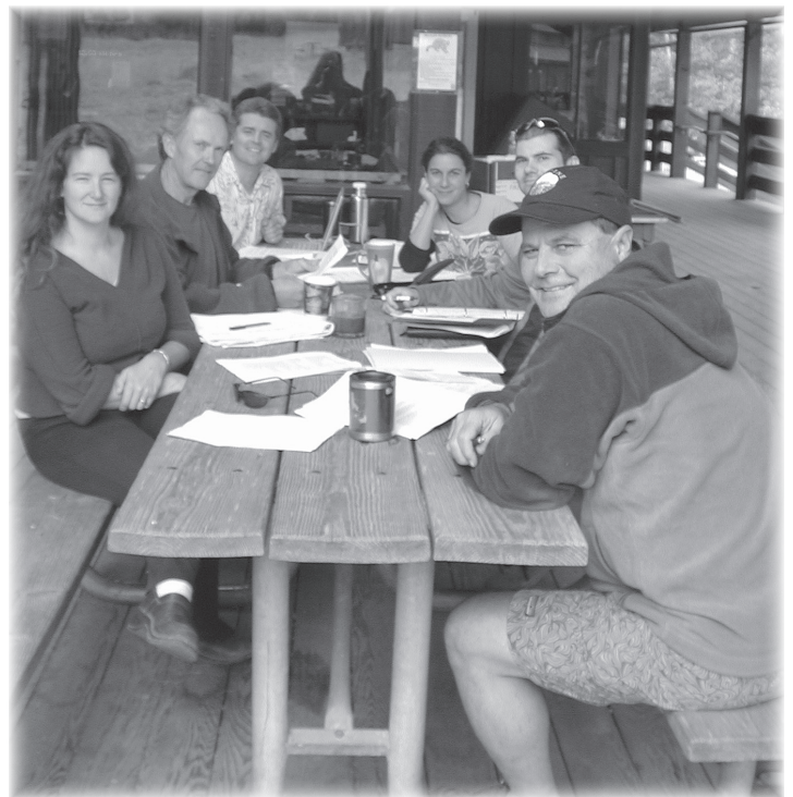
Some SRF Board and staff gather to brainstorm about the 25th Annual Salmonid Restoration Federation Conference.

our successors will one day no longer have the need for a restoration movement. But that's okay, because it means we will have restored what we have damaged, and we will be ready to move into the next phase—the phase of stewardship where we take care of what we have and make sure that we allow the forces of nature to work their magic unfettered by the mistakes and misguided efforts of human industry—like the Native Americans did before the European invasion. We still have a long way to go, but we are 25 years closer than when we started and we have a solid foundation to work from. As we celebrate the silver anniversary of the Salmonid Restoration Federation, let's think about how we as a movement have adapted, and how we will continue to adapt so our efforts continue to bear fruit 25 years into the future and beyond.