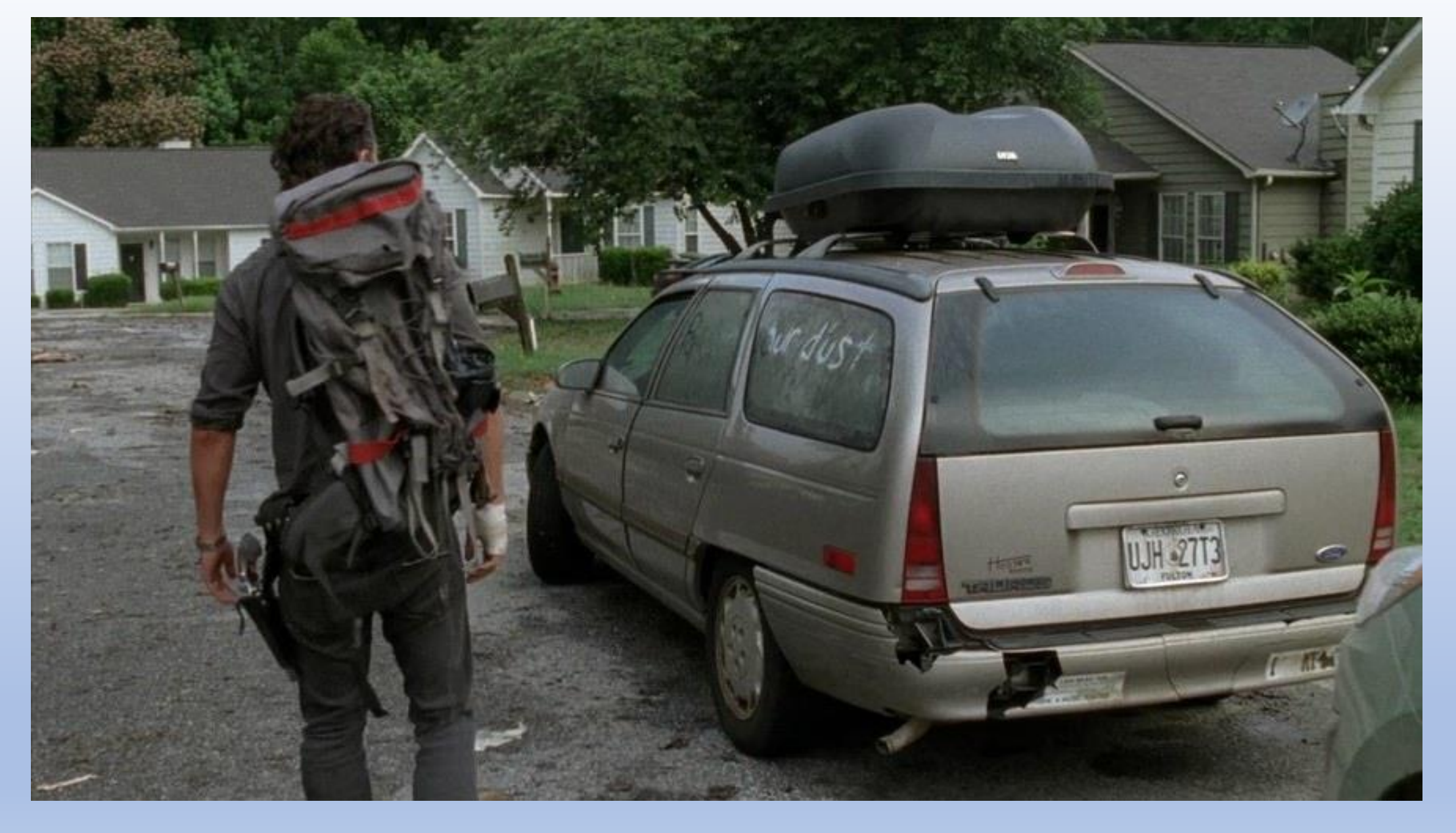
CDFW Ford Taurus (The jankiest State Car ever!)