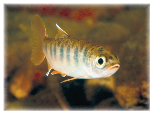
A juvenile coho

4. Restore habitat conditions and watershed processes across the range