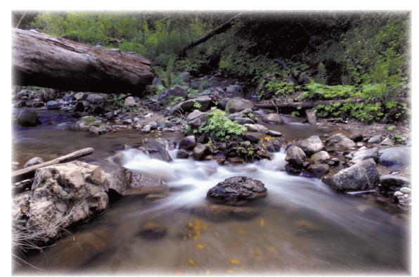
Upstream of the dam Corte Madera Creek supports native trout where steelhead once spawned.

The reservoir behind the dam also flooded a unique "confluence valley"