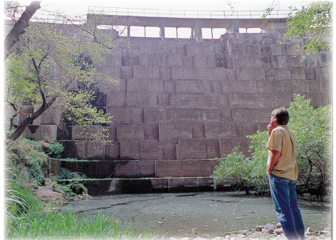
Salmonid Restoration Federation

Participants in the Dam Removal Tour will visit Stanford Universty's private Jasper Ridge Biological Preserve and tour Searsville Dam with the preserve director to discuss future challenges and opportunities with the nearly sediment filled reservoir and major steelhead migration barrier.