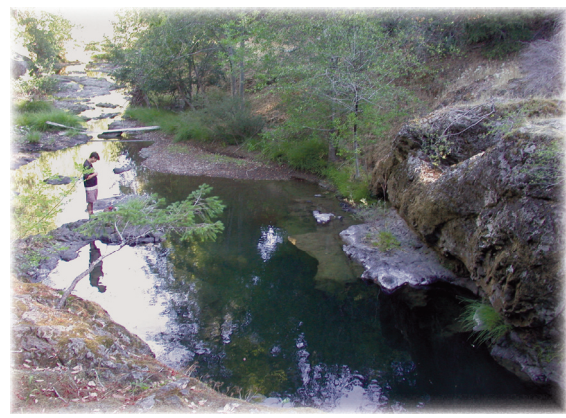
The Mattole River

Fire protection storage requirements may vary by county. In Humboldt County, homes in State Responsibility Areas for fire are required to maintain a reserve of 2500 gallons at all times to